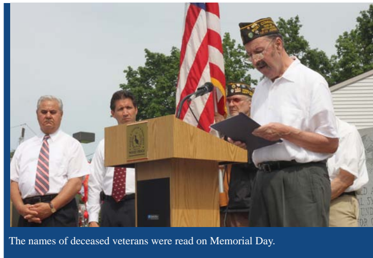
The names of deceased veterans were read on Memorial Day.

Veterans Park was enhanced earlier this year with a new basketball court, the installation of a bocce court, new swingsets, walkways and landscaping. The renovations were funded by a Community Development Grant,