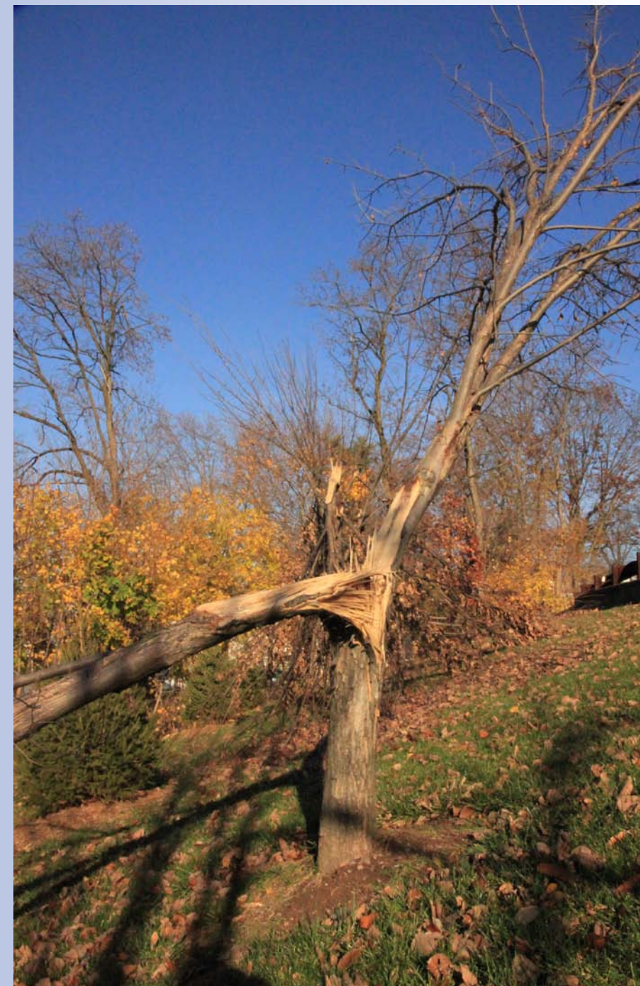
A Wood-Ridge tree brought down by winter’s early blast in October.

Though it suffered a late start, leaf collection was restored to a normal schedule for December. And the Borough of Wood-Ridge stands prepared, Altamura affirmed, to face whatever surprises mother nature comes up with next.