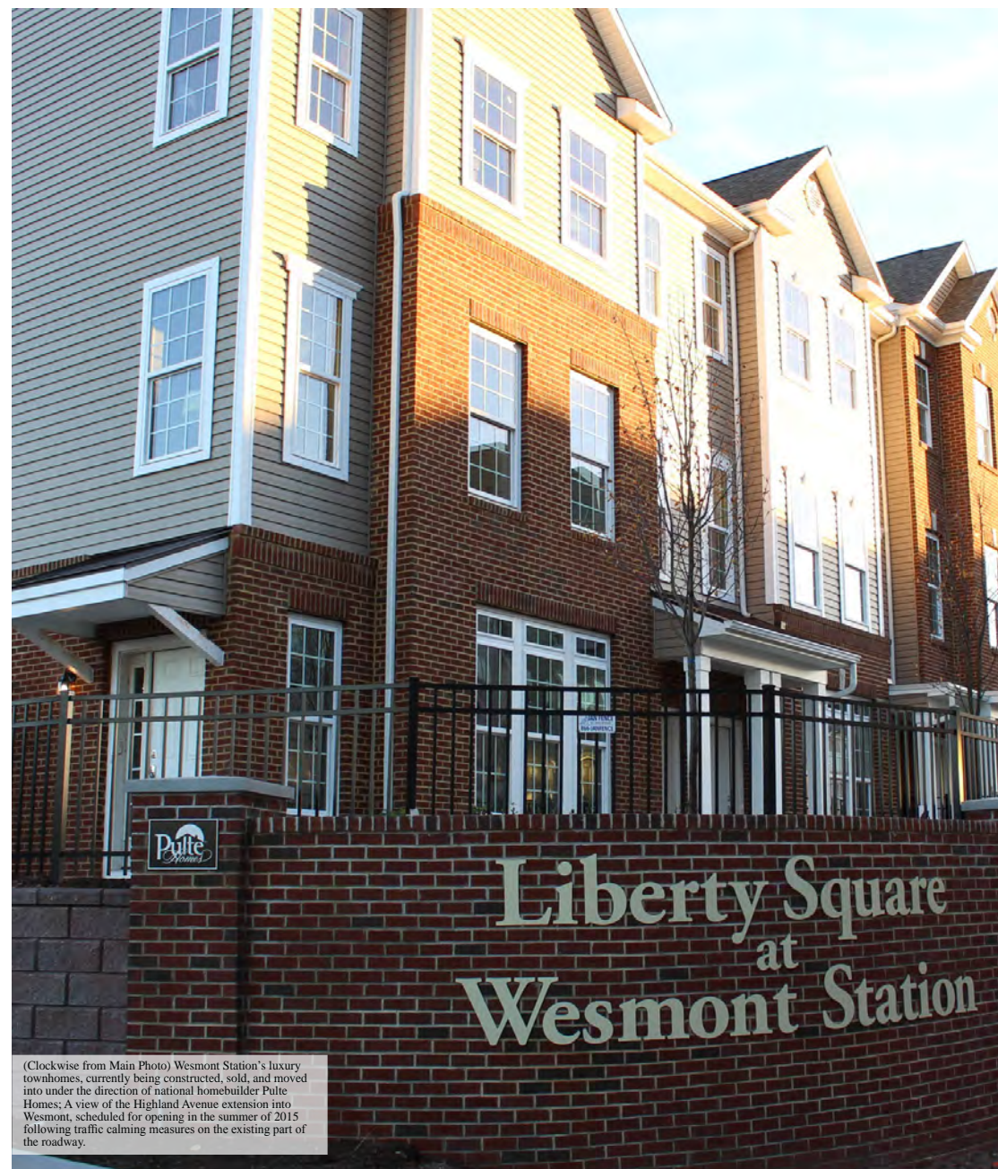
(Clockwise from Main Photo) Wesmont Station’s luxury townhomes, currently being constructed, sold, and moved into under the direction of national homebuilder Pulte Homes; A view of the Highland Avenue extension into Wesmont, scheduled for opening in the summer of 2015 following traffic calming measures on the existing part of the roadway.