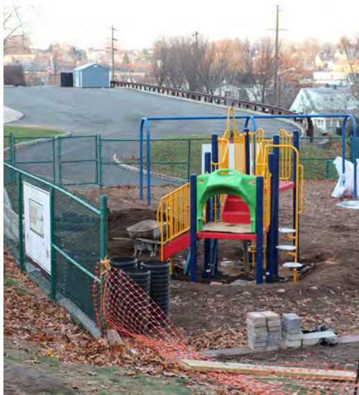
The new jungle gyms being installed at the 14th Street Park are funded by grants.

DiMarco also reported on several future projects, including the overhaul of bleachers and fencing at the 6th Street Little League Field, to be funded with an additional $150,000 Open Space Grant from the county. Plans are also in place to upgrade Kohr’s Park on 13th Street in 2015.