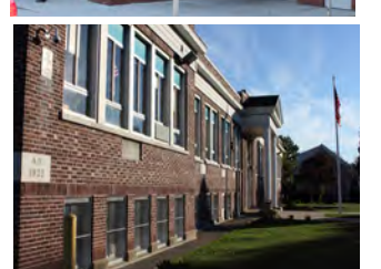
A comprehensive series of improvements at Doyle, Ostrovsky and Wood-Ridge High Schools will bring enhanced security, comfort, and educational resources to the three buildings during 2015-2016.