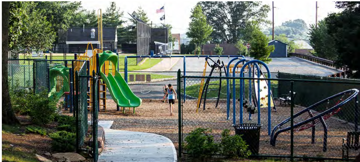
Recent improvements to Wood-Ridge's parks have included the installation of new playground equipment at 14th Street Park (above) and Veterans Park (right).

New Playground Being Considered for Catherine E. Doyle School