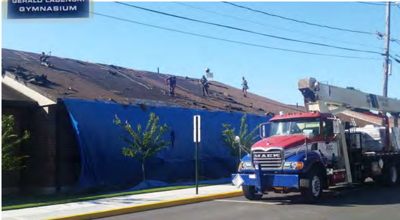
(PHOTOS, TOP) Work is currently underway this summer to transform the gym at Wood-Ridge Jr./Sr. High School into a state-of-the-art facility for students, teams and spectators; work at Catherine E. Doyle School (3RD PHOTO) includes a new boiler and new roof.