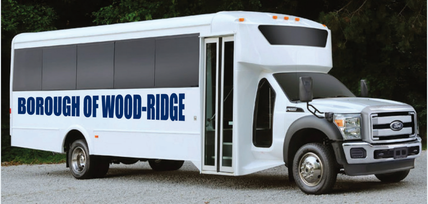
Above: The Borough of Wood-Ridge's new Elgin Whirlwind Street Sweeper and Ford Senior Bus are on the way.