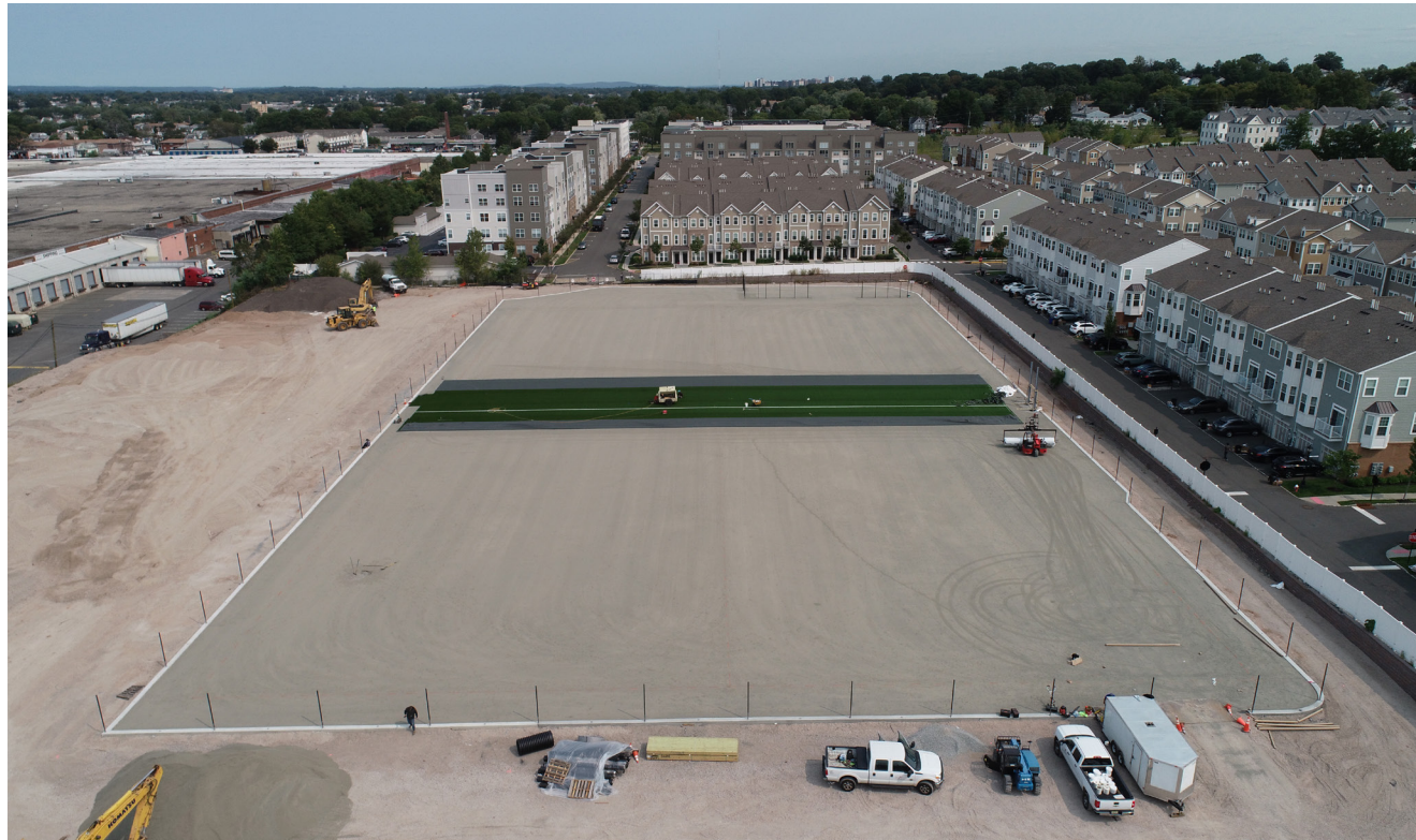
(CLOCKWISE FROM LEFT) Artists' renderings and construction photos of facilities at the all-new Wood-Ridge Athletic Complex, including photos of the new soccer field being rolled out at the WRAC.